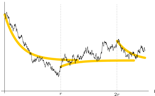
FIG. 2. Splitting the process into fluid-scaled parts, starting at 0, r, 2r, \dots

7.1. Outline of the proof of Theorem 7.1. The outline of the proof of Theorem 7.1 is as follows. We are interested in the dynamics of \hat{\mathbf{q}}^r(t) over t \in [0, T] , that is, of \mathbf{Q}^r(\tau) over \tau \in [0, r^2T] . We will split this time interval into \lfloor rT \rfloor + 1 pieces starting at 0, r, 2r, \dots , and look at each piece under a fluid scaling. We will define a “good event” \hat{E}_r under which the arrivals in all of the pieces are well behaved (Section 7.1.1). We then apply Theorem 4.3 to deduce that, under this event, the queue size process in each of the pieces can be (uniformly) approximated by a fluid model solution (Lemma 7.3). We then use the properties of the fluid model solution stated in Theorem 5.4 to show that in each of the pieces, the queue size is (uniformly) close to the set of invariant states (Lemmas 7.4 and 7.5). Figure 2 depicts the idea. Finally we show that \mathbb{P}(\hat{E}_r) \rightarrow 1 (Lemma 7.6). The formal proof is given in Section 7.1.2.